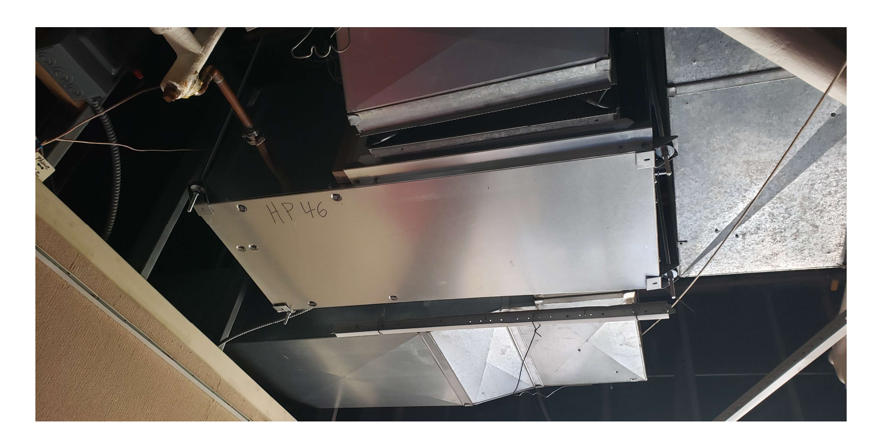
New heat pump installed